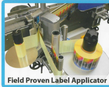
Field Proven Label Applicator