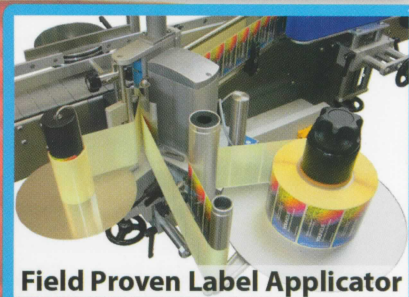
Field Proven Label Applicator