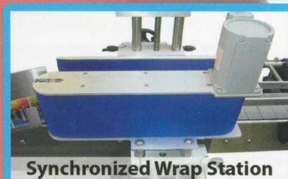
Synchronized Wrap Station