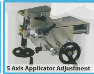
5 Axis Applicator Adjustment