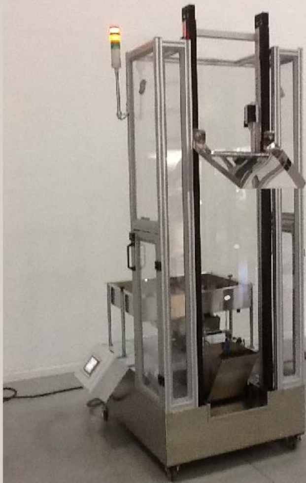
Ergonomic Vertical Tablet Elevator